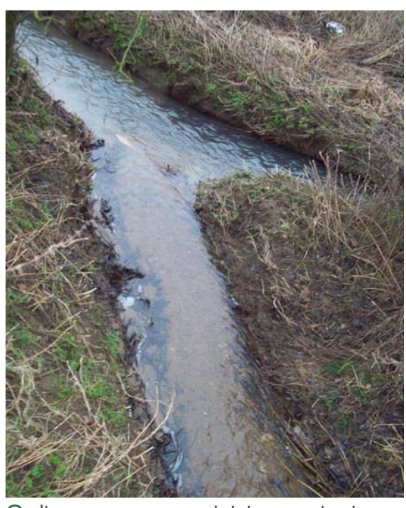
Ordinary watercourse joining a main river

This is highlighted by the picture below which shows an Ordinary Watercourse joining the Main River Evenlode at Moreton-in-Marsh.