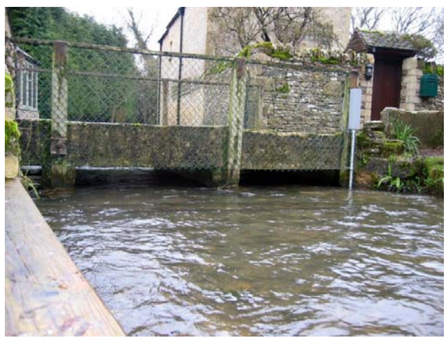
An automatic water monitoring system can act as an early warning precaution.

In addition to the clearance works, the community has also installed an automatic water monitoring system in the river as an early warning precaution. The equipment allows the villagers to monitor the water levels and helps them to predict the likelihood of an impending flood.