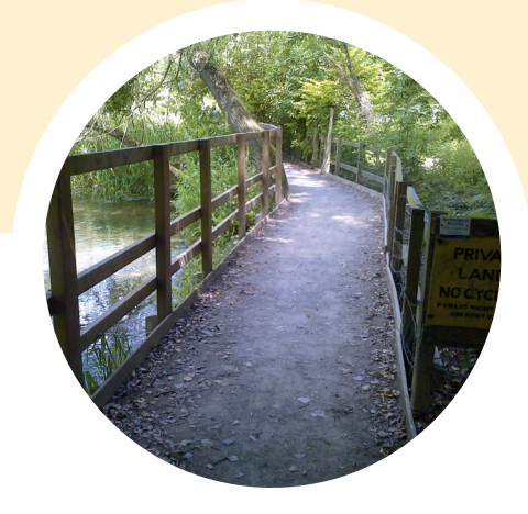
6. Near Dilly's Bridge the public footpath was raised. This reduces the flood risk to Courtbrook.

5. At Gas Lane a sheet-piled wall, earth bund and a low-level flood wall were built. This reduces flood risk to Gas Lane and Back Lane.