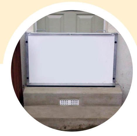
7. At Courtbrook 7 properties have been given flood-protection products. This includes door guards and airbrick covers.