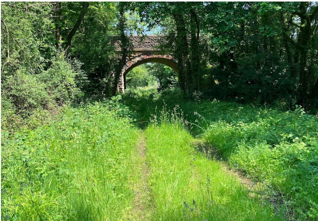
Figure 3 - Photo showing track of former railway and Lower Slaughter bridge

Going forward, stakeholder engagement should also be considered with the communities of Bourton on the Water, Stow on the Wold and Kingham to promote the route and confirm public support.