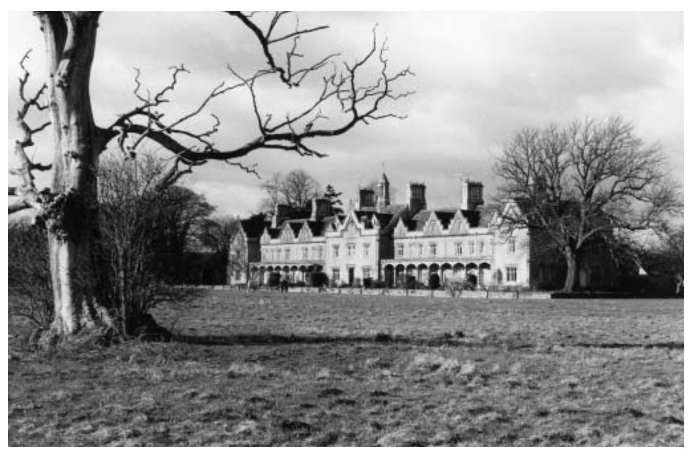
Edwards College is an impressive building of the Gothic style which fronts an expanse of open fields which eventually lead southeast to Chapter Manor. Although not publicly accessible, this is a very important open space within the Conservation Area.