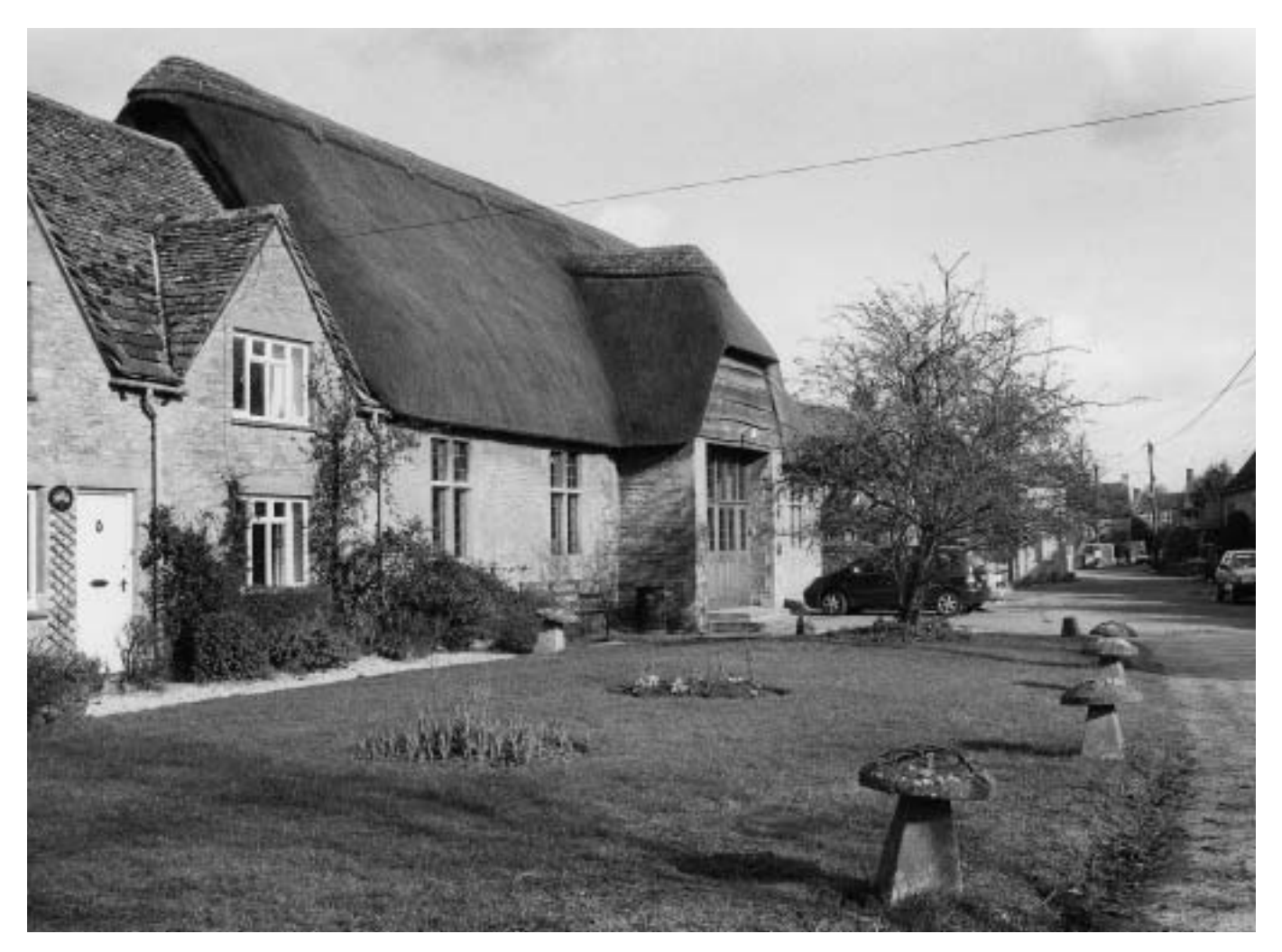
The green verges, trees, shrubs and staddle stones of this part of School Lane form a contrast with the more built-up eastern section of the lane.

The working nature of the village contributes to its character. Whilst some of its traditional character has been lost to new development, this can be reasserted through sensitive design and appropriate materials. The new development at Station Road on the eastern approach to the village shows what can be achieved.