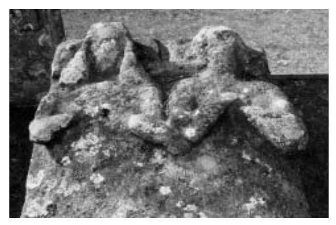
This table tomb nearest the door to All Hallows Church is known locally as 'Cutts Tomb'. The identity of the male and female effigies carved atop is not known, though they are thought to be wealthy and influential figures from the late 14th century.

Standing on the humped-back bridge, there is clearly a change in the ambience and character of the Conservation Area. The relative peace of Silver Street gives way to the more bustling activity of the shops and services on Clark's Hay. Several important buildings situated on street corners here, do much to define the character and appearance of this area. A key building is Bridge House to the north east, set back from the street behind a lawn - a large traditionally-detailed stone building, which is known to incorporate a medieval house.