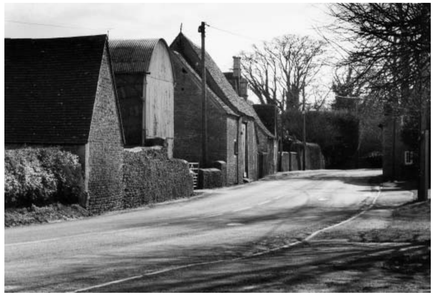
At the northern end of the village, Berry Farm comprises traditional and more lightweight modern farm buildings which hug the roadside. Gaps between the buildings allow glimpses through to a flat agricultural landscape.

Once beyond Berry Farm the road veers away to the right, and eventually disappears between another bottleneck created by two prominent buildings: Liddell House and Gable Cottage.