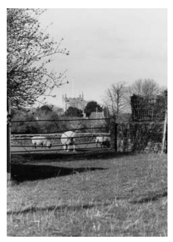
The presence of two working farms and open fields at the heart of the village are instrumental to its character. This is best understood along Station Road where one can view another strand of the village, and the Church tower, through the outbuildings and across the fields behind Boxbush Farm.

Entering the village from the east, Boxbush Farm, with its ancillary outbuildings and fields, and Boxbush Cottage, is a