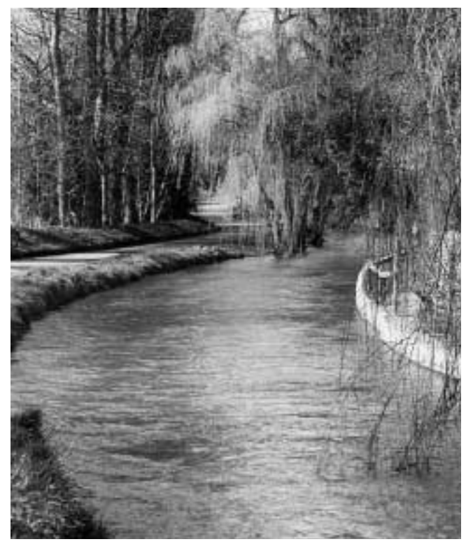
Midway along Bow Wow, the visual connection with the builtup part of the village is lost. The tree-lined River Churn can be both overflowing or a mere trickle, depending on the season.

view north, and attention is therefore focussed onto the vista along Bow Wow. The river, surrounded by trees and shrubs, animates and enhances the whole scene, particularly the garden setting of the south and west faces of Lower Churn, as this house is reached. On the northern side, the water is almost motionless, while on the south it is fast flowing until it can be seen joining the mill stream at a noisy confluence a short distance to the south.