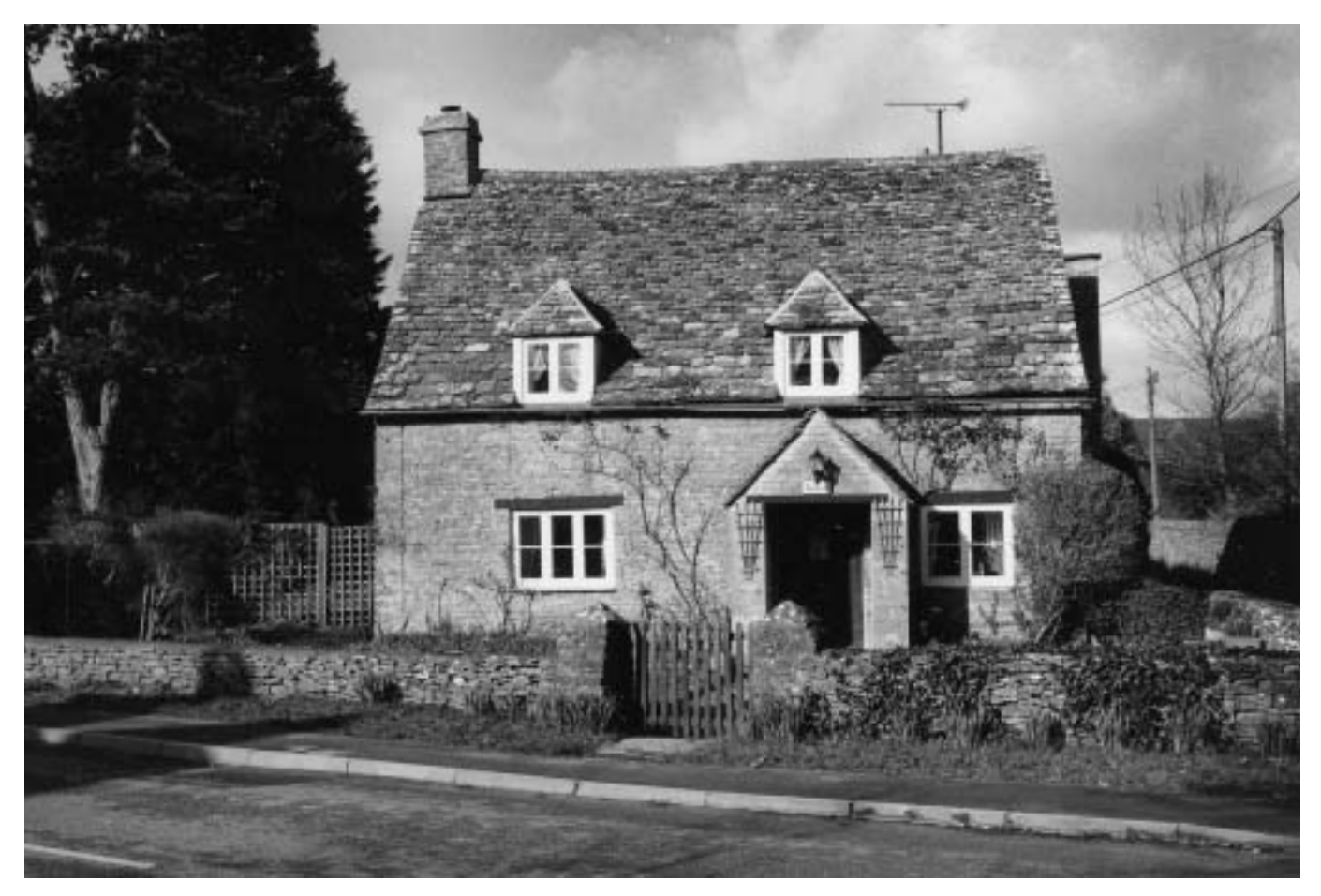
Upper Up is quite distinct from other parts of the village. Its many traditional stone cottages, such as Radnor pictured here, are dispersed within, and set against, a backdrop of mature trees.

grounds. It is only partially visible due to the high boundary wall and mature cedar tree situated within its front garden. Its distinctive dormer windows, tall chimneys and Welsh slate roof are typical of the Gothic style.