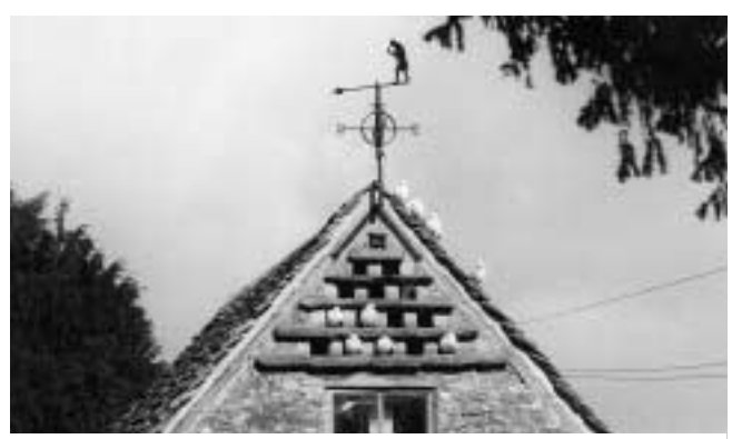
Bow Wow affords glimpses of Chapter Manor and its ancillary buildings. The doves gathered around their holes in this gable end are a particularly distinctive and memorable feature.

Chapter Manor, resulting in an intimate courtyard-like atmosphere. It is enhanced by numerous trees, grass verges, and the splay of another entrance into Chapter Manor and the open front garden of Lower Churn. Chapter Manor plays a significant role in the Conservation Area at this point, as it exudes the grandeur of a large house, but it is also discreet behind its walls and screen of trees. There is a dovecote built into the gable end of the stable block, and, at times, many white doves can be seen roosting or in flight. Other details such as the distinctive weather vane, numerous chimneys of varying styles and materials, and a delicate metal-framed greenhouse also enrich the scene. Beyond the manor is a range of stone-built stables, small outbuildings and large barns, with a mixture of roofing materials, and a range of boundary treatments: dry-stone walling, timber fences and gates.