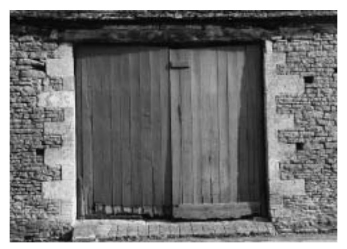
Although in need of some attention, the main barn door at Berry Farm is one of many fine examples of traditional agricultural features to be seen in the farm buildings of the village.

Some open spaces and trees have been identified as being crucial to the character of the place and should be preserved. These are indicated on the map accompanying this Statement.