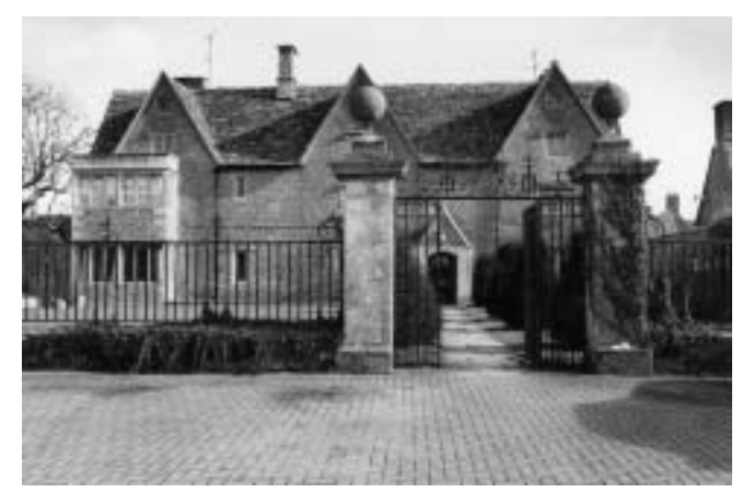
Atkyns Manor, set back on the eastern side of Silver Street, is the most prominent of several large houses dispersed around the village. It is characterised by its simple but effective use of gabled dormers, and imposing 18th century gate piers and wrought iron gates.

High Street, further south. To the east, the tree-lined walk of Bow Wow can be seen extending for some distance along the course of the river; whereas to the west the riverside view is curtailed by a bend in the river as it passes between the Eliot Arms and the trees on either side of the bank. The river, which forms a wide pool to the west of the bridge before splitting into two branches, is enhanced by several willow trees which drape their leaves directly into the water. It is a noisy river when in full spate.