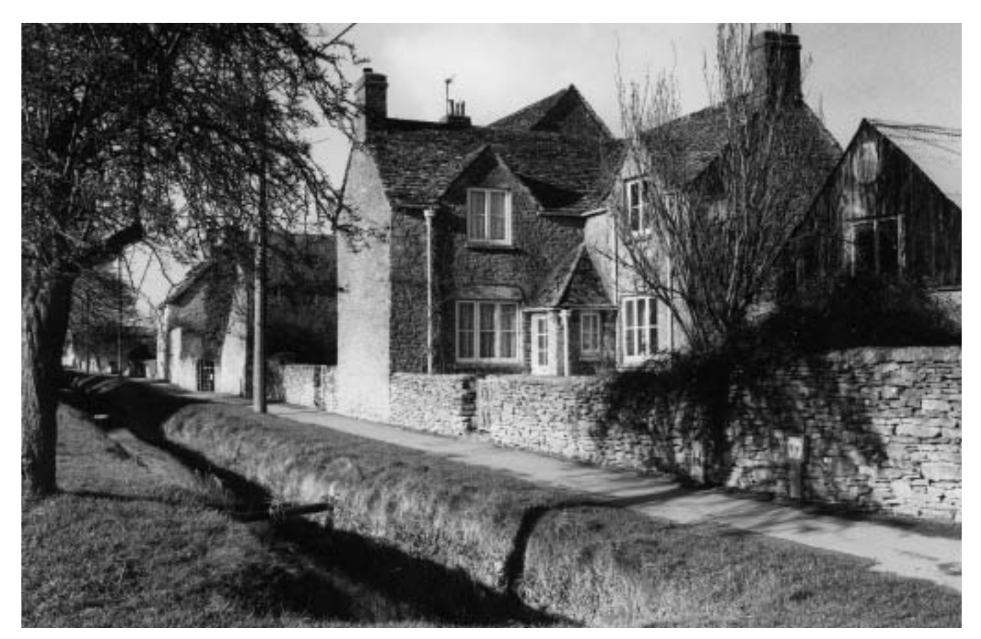
The long ditch which runs through a green swathe for almost the whole length of Station Road is one of the most remarkable features in the village. Here it passes in front of the well preserved farmhouse grouping of Boxbush Farm on the northern side of Station Road.

This part of the Conservation Area reaches its western limit at the junction of High Street and Broadway Lane, where the War Memorial stands on a small grass island in the road. The grass verge is still prominent here, although from this point on it narrows and loses its impact. A delightful feature of the