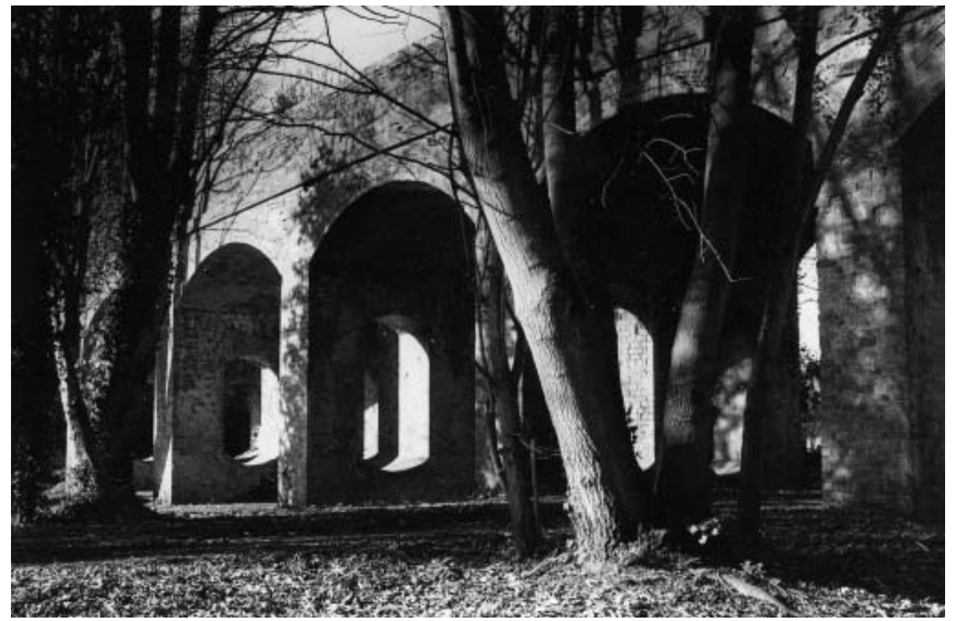
A disused railway bridge carries the lane out of the village at the eastern extremity of the Conservation Area. On top it provides a rare elevated platform for viewing the expanse of meadowland to the north. From below its magnificent structure of brick arches sets a quite contrasting intimate scene.

Several larger buildings situated on the northern side of School Lane are of a range of architectural styles and materials, also playing an important role in shaping the