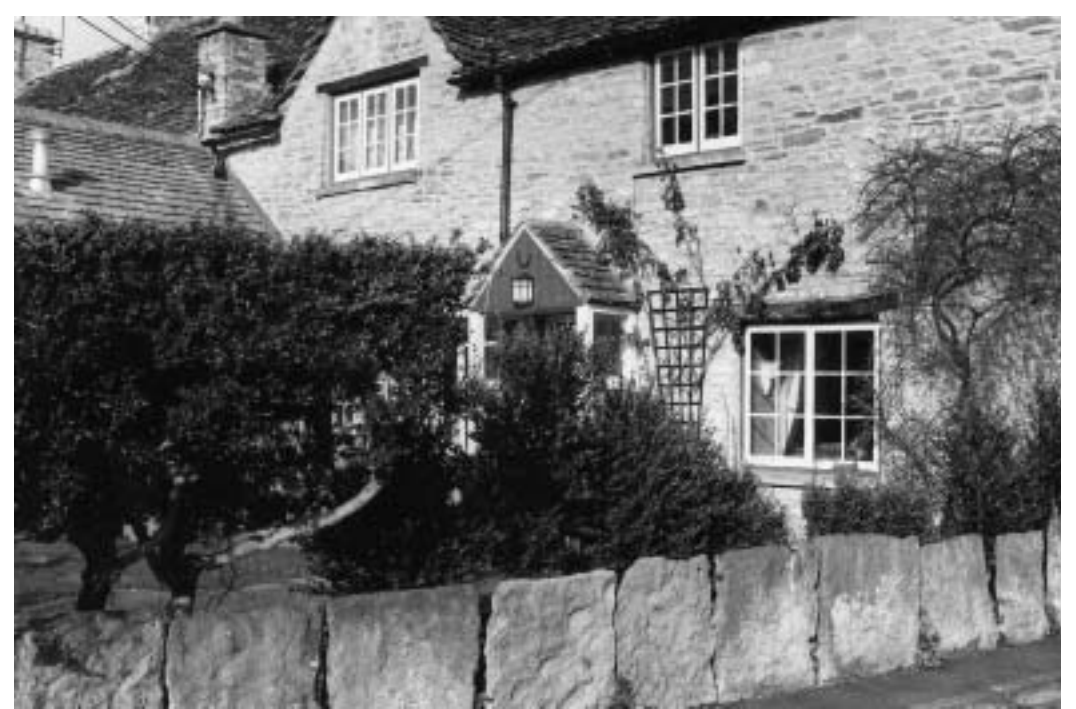
School Lane begins with a very distinctive boundary treatment formed from large stone slates. The rear elevation of Highnam Cottages reveal themselves to be very well preserved examples of traditional cottage architecture.

character of the space. The Village Hall, the front part of which was formerly a barn, is a rubble stone building of some significance within the village, particularly because of its distinctive thatched roof. Brook House is large, ashlar-faced and three storey, in the restrained classical style of the Georgian period. Together with Upper Mill House, it stands square on to School Lane enclosing this edge of the space.