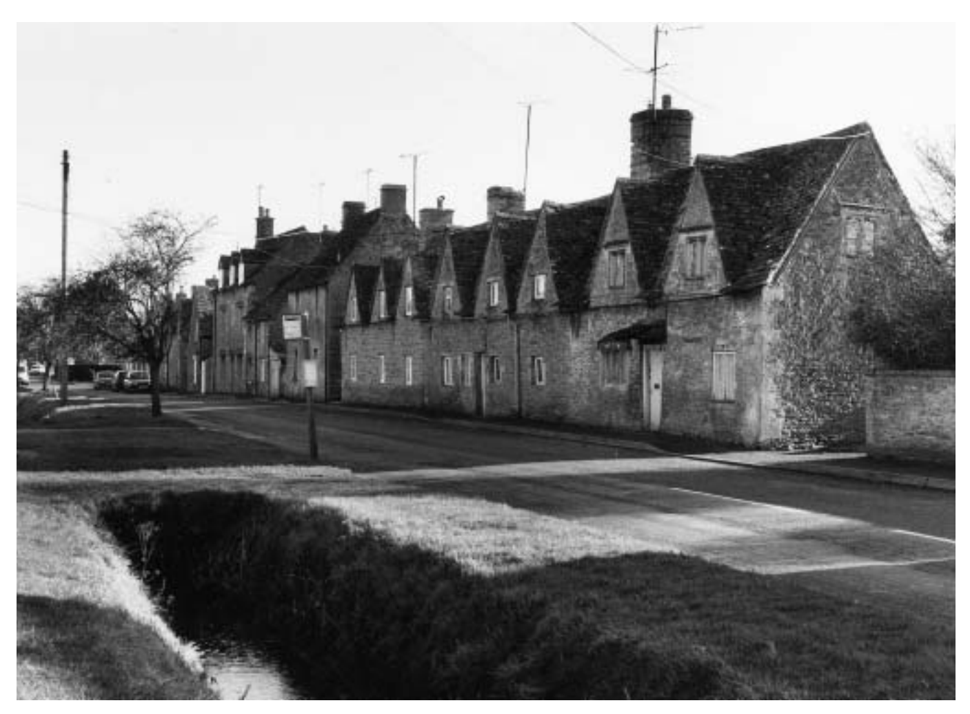
Station Road, one of the widest village streets in the Cotswolds, is also notable for its long row of 16th Century cottages.

northern side of High Street are the raised gardens of The Cottage and Ivy Cottage, which may have been kitchen gardens in the days when self sufficiency existed throughout the village. These gardens, against a backdrop of traditional stone cottages, provide much greenery and depth and lend an idyllic village atmosphere to the setting of the High Street. The Conservation Area ends at Pike House and Corner Cottage on the southern side of the road, before the streetscape gives way on either side to more recent development.