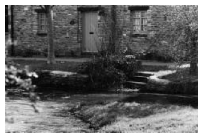
Several sets of stone steps can be found on the southern bank of the river. These may have served a practical purpose in the past.

To the south of the road, there is a distinctive area comprising several traditional cottages and houses, loosely distributed in plots of roughly equal size. Interestingly, it is known that these buildings, and the whole site, were formerly used in connection with a small local brewery. Trees, shrubs and hedges are also important here, framing views through to the buildings, creating a sense of intimacy which is heightened in spring when the canopy grows to further restrict views. Looking west, the pinkish appearance of Well Cottage enlivens the scene, and Rose Cottage standing almost square