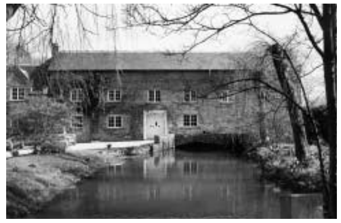
Lower Mill standing astride the mill race, and framed in trees, terminates the vista in a most effective manner forcing the pathway to veer north before it continues east.

After crossing the river by a small humped-back bridge, an irregular open space is entered, contained by the north-facing