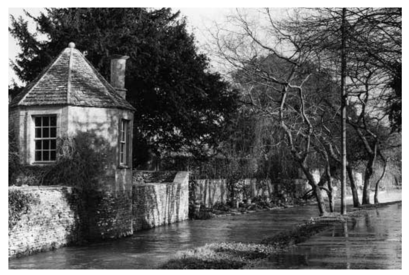
Bow Wow is one of South Cerney's most valuable assets, which contributes greatly not only to the character and appearance of the Conservation Area, but also to the quality of village life. It is characterised by a series of pleasant buildings and views, always to the accompaniment of the river and trees.

Past the mill, a tall evergreen hedge backed by the high boundary wall of Chapter Manor's grounds, prevents any