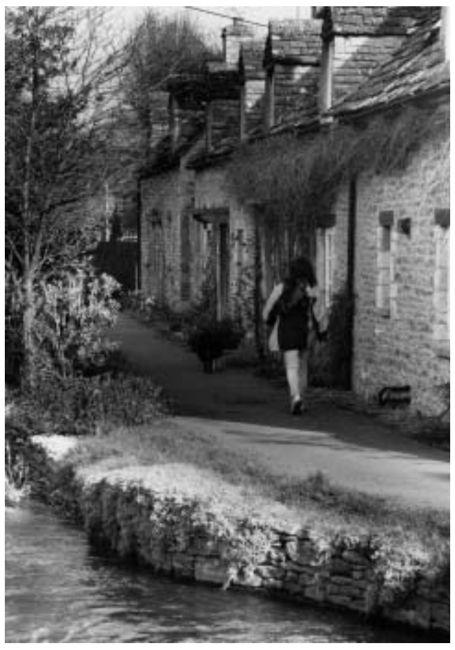
Further down School Lane the narrowness of the river causes it to be faster flowing than elsewhere in the village. This combined with the diminutively scaled bridges and cottages on the southern bank, lends this part of the village an altogether different character.

The Stables, standing directly on the street, was converted to residential use in 1984, and crucially still retains much of its original character. Adjacent to it is, in contrast, a large Victorian house set back from the street within generous