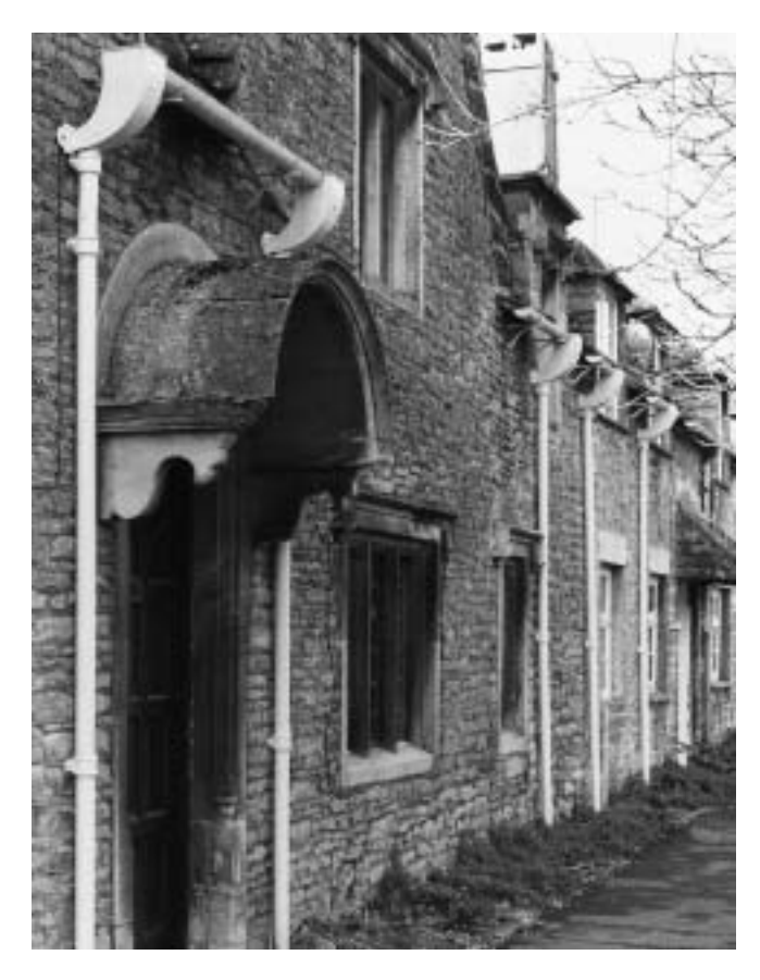
The distinctive architectural details and painted cast iron rainwater hoppers of the cottages on the west side of Silver Street help to enliven the scene.

standing in their own grounds, some on the street frontage and others beyond nearer to the Church.