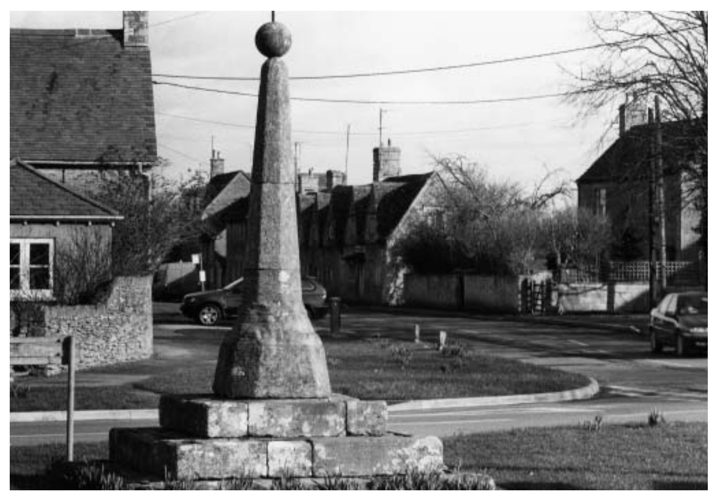
The medieval cross stands at the centre of the village, and acts both as a landmark aiding orientation, and a tangible reminder of South Cerney's long history.

South Cerney Conservation Area was first designated on 4 November 1970, and the boundary was altered on 23 May 1990, 29 July 1993 and 15 June 1999.