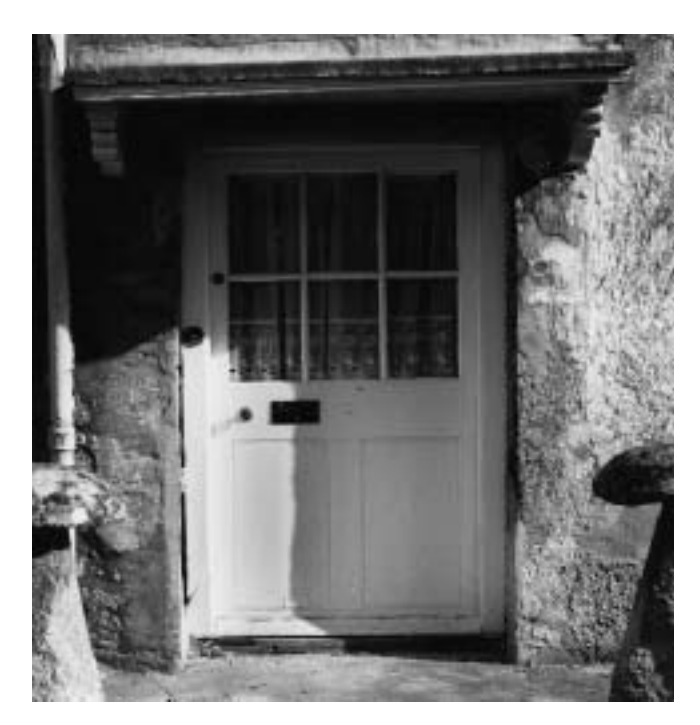
Where they survive, the retention of traditional architectural details such as windows, doors, stone slate roofs, canopies, cast iron rainwater goods, staddle stones, and (where found) limewash, are essential to the preservation of the character and appearance of the Conservation Area.

The earlier cottages, such as the row on Station Road, dating originally from the sixteenth century, have stone mullioned windows, as does Atkyns Manor. However, by the middle of the eighteenth century, painted timber doors and casement windows predominate in the more modest cottages.