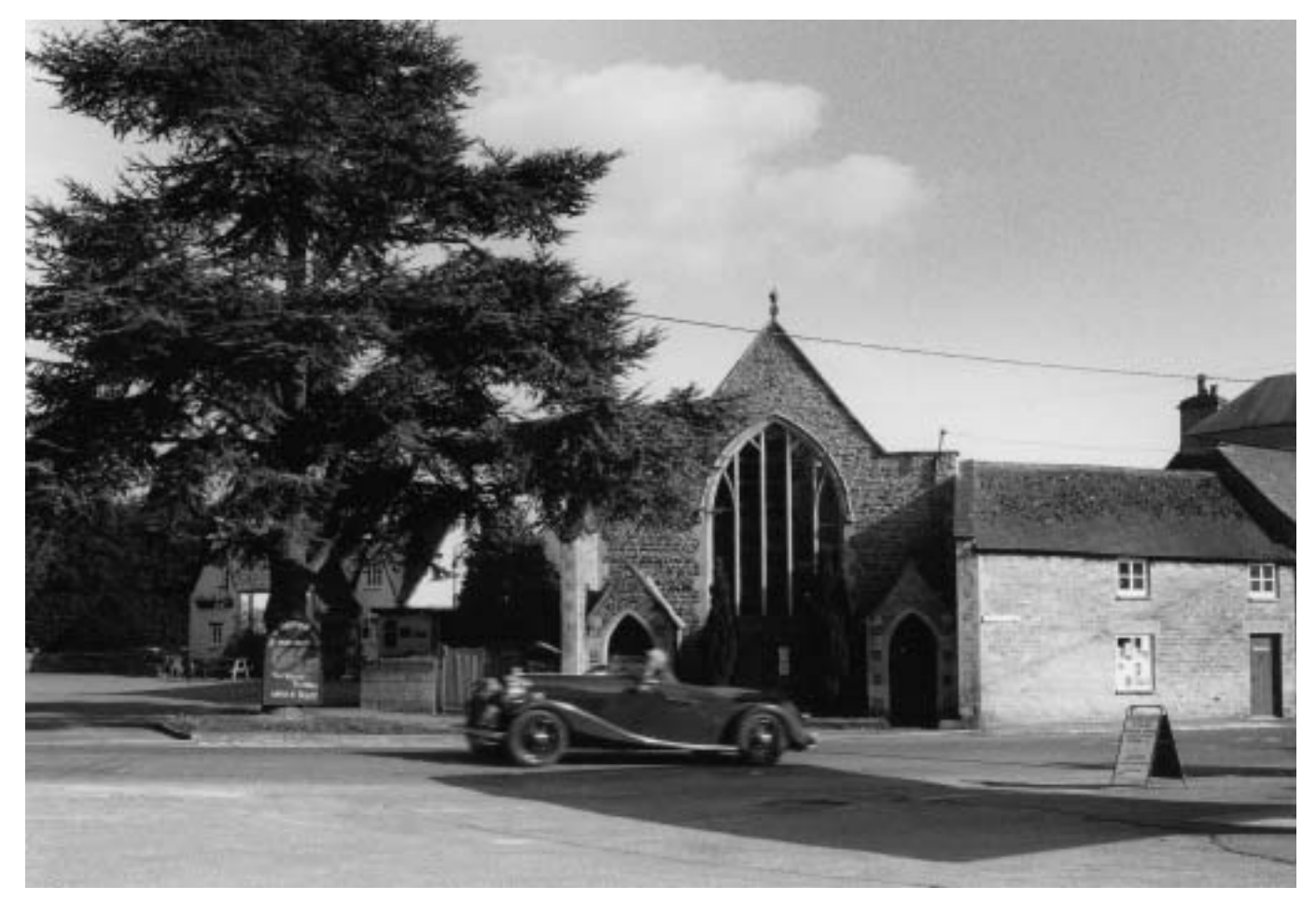
There is a profound contrast between Silver Street to the north, and Clark's Hay to the south of the Churn at the centre of the village. Clark's Hay is its commercial centre, characterised by a mix of old and modern buildings which serve various village needs.

The character and appearance of this part of the Conservation Area are quite different from that of the others. Essentially, Bow Wow is a narrow lane, bounded on one side by the River Churn and on the other by the mill stream, passing between trees and meadows on either side, and some secluded houses. Bow Wow is entered, at the west end, directly off the stone