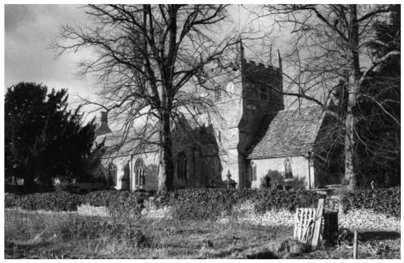
One of the best views of All Hallows Church is obtained from the allotments which lie immediately due south. There are many interesting footpaths and views to be experienced to the east, just beyond this point.

and the allotment gardens to the east, viewed over a simple five bar gate. A narrow footpath skirts around the northern edge of the allotments alongside the churchyard wall, eventually connecting this part of the village with the River Churn. The allotment gardens are relatively well kept and alive with flowers, vegetable patches and the paraphernalia of gardening, providing a setting for the Church when viewed over the River Churn.