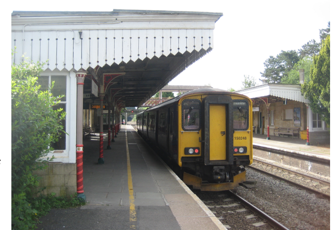
Kemble Railway Station

2.0.22 Much of the District has good road links, with easy access to the motorway network via A-class routes, although this does not apply to the northernmost