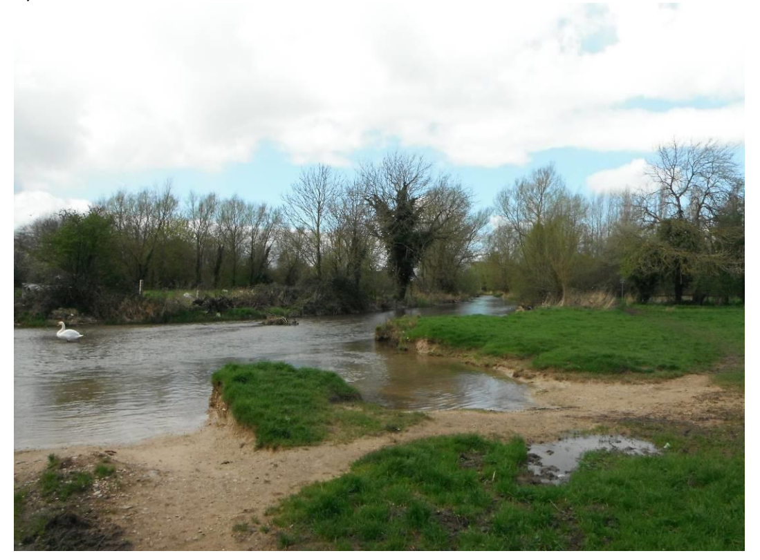
Photo 14 yet again the river returns to its over-wide, straight form overall the river was one of the most featureless sections of river within the waterpark area

Photo 13 as the river moves away from the town the land becomes more pastoral here the banks have been damaged by vehicle access across the river