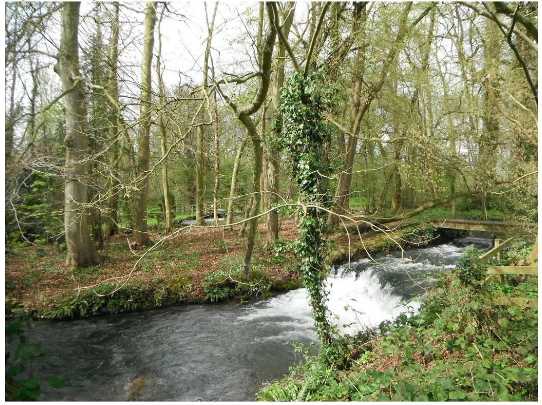
Photo 6 where the island narrows the channel has better flow allowing aquatic plants like Ranunculus spp. to grow this however this is the only area it was noted

Photo 5 at the downstream end of the island there are two weirs which are obviously one of the many barriers to fish migration along the River Coln