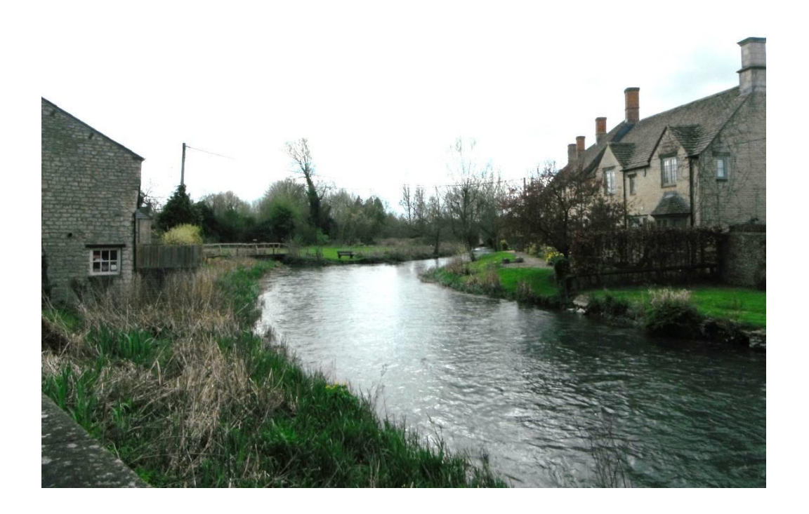
Photo 12 the river downstream of the town is still overwide and straight but it does have footpaths alongside it meaning local people have a good connection to the river

Photo 11 downstream of the bridge there are some homes built very close to the river and the channel soon splits again to indicative of another historic mill site.