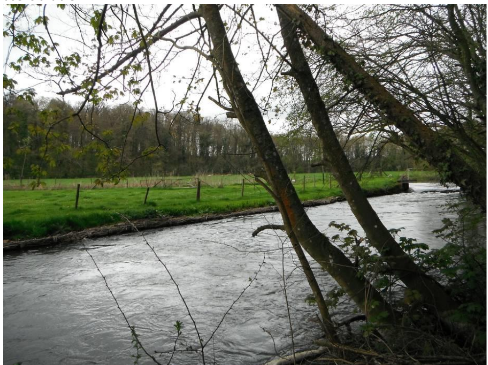
Photo 2 the river is overwide and straight providing a very poor variety of habitats; however there is some Large Woody debris present providing some variation

Photo 1 the river at the most upstream end of the Fairford parish is very wide straight and shallow and the adjacent land use is arable