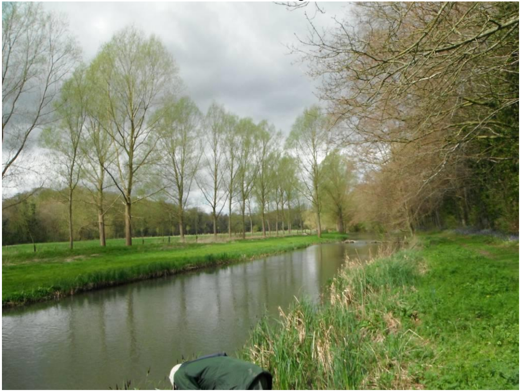
Photo 4 the river here has a island in the middle which improves flows by narrowing the river to two channels

Photo 3 the river is still over wide shallow and straight with no variation in the habitat